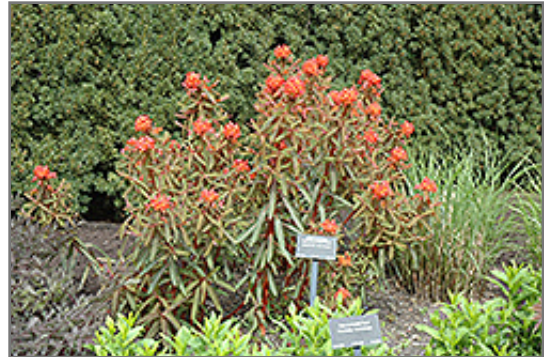
Dixter Spurge in bloom