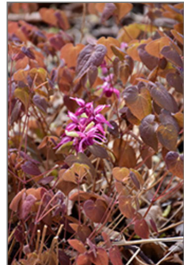
Yubae Bishop's Hat flowers

Yubae Bishop's Hat is recommended for the following landscape applications;