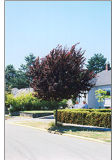
Newport Plum