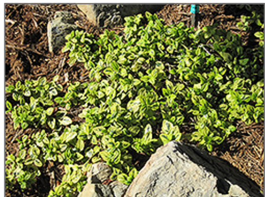
Diamond Heights California Lilac