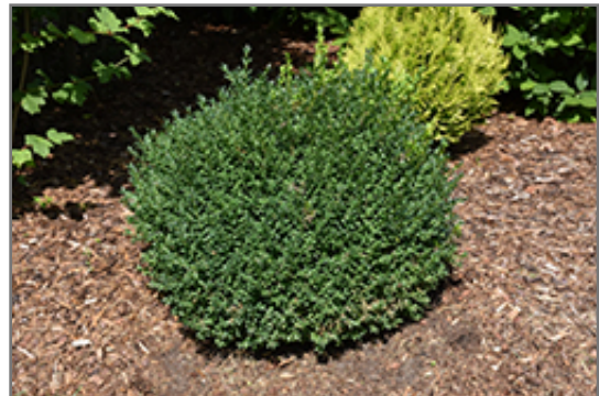
North Star Boxwood