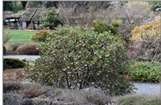
Common Manzanita in bloom