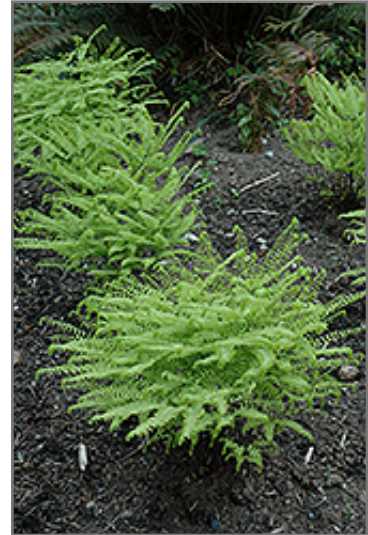
Western Maidenhair Fern