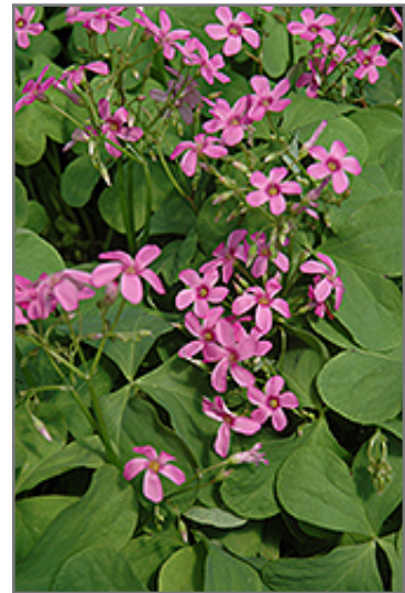
Pink Wood Sorrel flowers