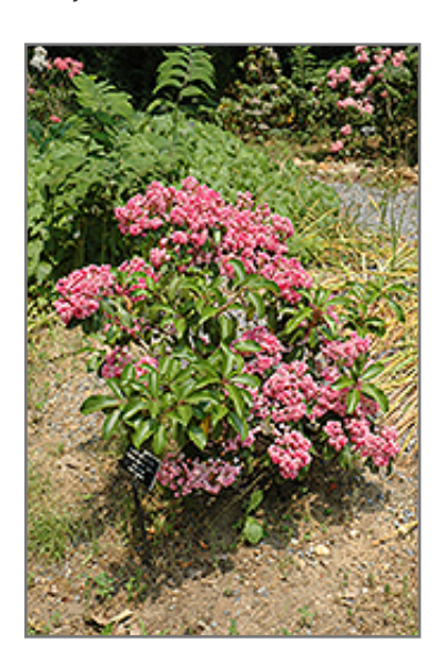
Carol Mountain Laurel in bloom