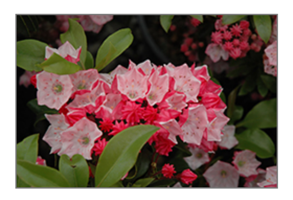
Carol Mountain Laurel flowers