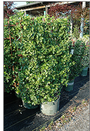
Manhattan Spreading Euonymus