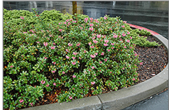
Newport Dwarf Escallonia in bloom