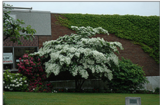
Lustgarten's Weeping Chinese Dogwood in bloom

This is a relatively low maintenance tree, and should only be pruned after flowering to avoid removing any of the current season's flowers. It is a good choice for attracting birds to your yard. It has no significant negative characteristics.