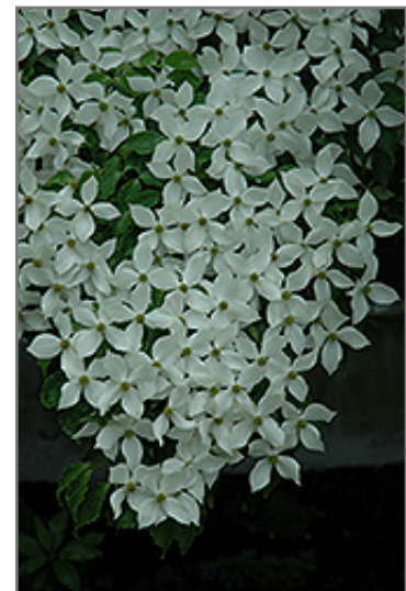
Lustgarten's Weeping Chinese Dogwood flowers