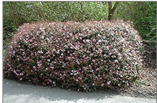
William's Rhododendron in bloom