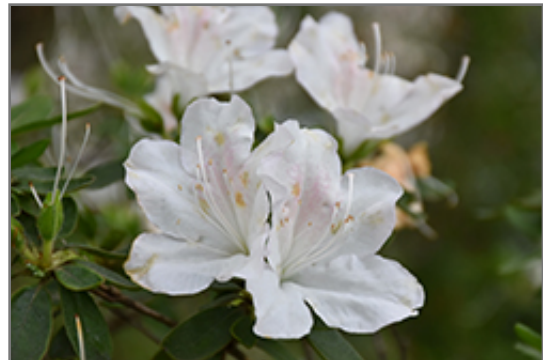
Treasure Azalea flowers

Treasure Azalea will grow to be about 6 feet tall at maturity, with a spread of 6 feet. It tends to be a little leggy, with a typical clearance of 1 foot from the ground, and is suitable for planting under power lines. It grows at a slow rate, and under ideal conditions can be expected to live for 40 years or more.