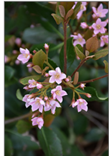
Pink Lady Indian Hawthorn flowers