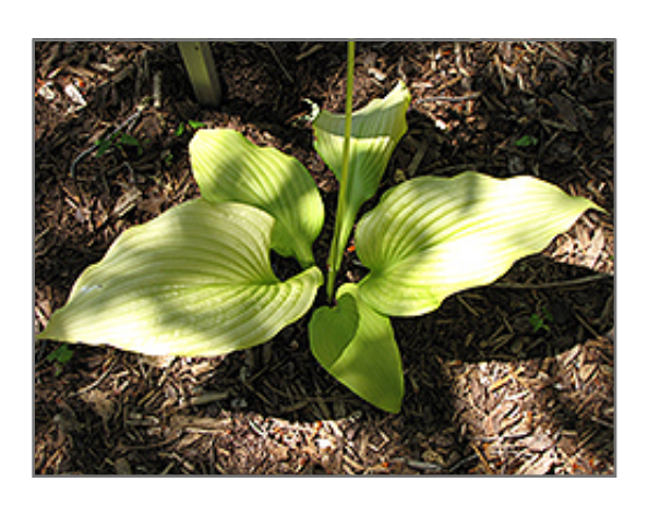
Templar Gold Hosta