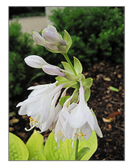
English Sunrise Hosta flowers