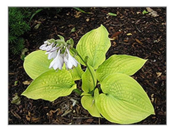
English Sunrise Hosta

This is a relatively low maintenance plant, and is best cleaned up in early spring before it resumes active growth for the season. Gardeners should be aware of the following characteristic(s) that may warrant special consideration;