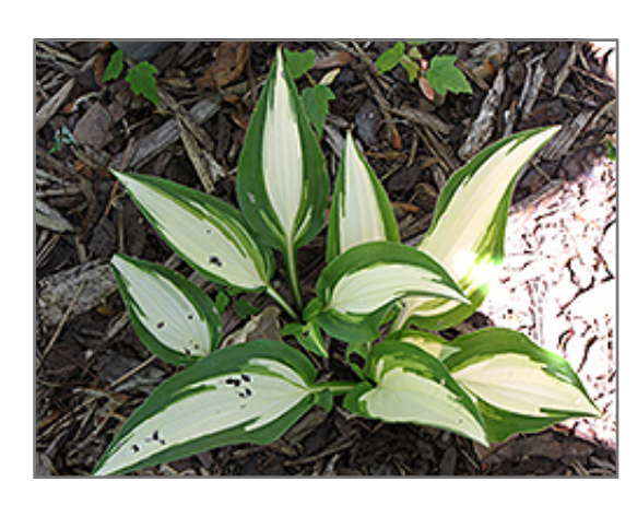
Calypso Hosta