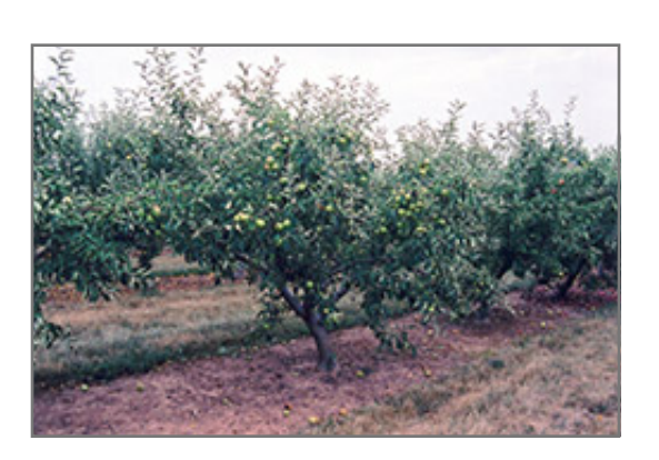
Jonagold Apple

This tree is typically grown in a designated area of the yard because of its mature size and spread. It should only be grown in full sunlight. It prefers to grow in average to moist conditions, and shouldn't be allowed to dry out. It may require supplemental watering during periods of drought or extended heat. It is not particular as to soil type or pH. It is highly tolerant of urban pollution and will even thrive in inner city environments. This particular variety is an interspecific hybrid.