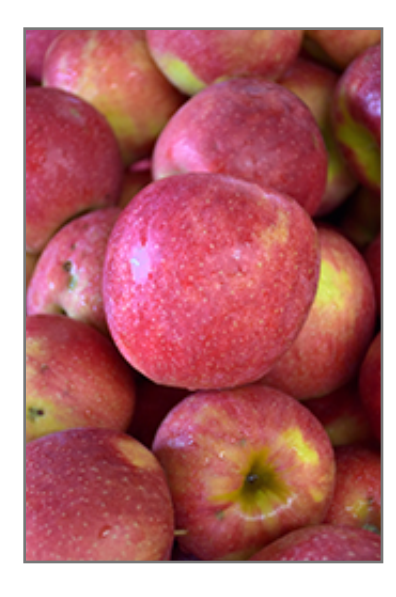
Jonagold Apple fruit

Jonagold Apple features showy clusters of lightly-scented white flowers with shell pink overtones along the branches in mid spring, which emerge from distinctive pink flower buds. It has forest green deciduous foliage. The pointy leaves turn yellow in fall. The fruits are showy yellow apples with a scarlet blush, which are carried in abundance in mid fall. The fruit can be messy if allowed to drop on the lawn or walkways, and may require occasional clean-up.