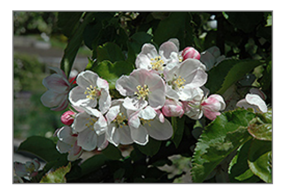
Jonagold Apple flowers