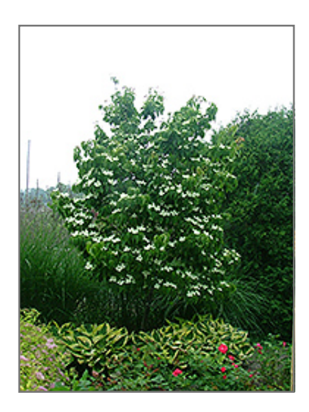
Galilean Chinese Dogwood in bloom

This is a relatively low maintenance tree, and should only be pruned after flowering to avoid removing any of the current season's flowers. It is a good choice for attracting birds to your yard. It has no significant negative characteristics.