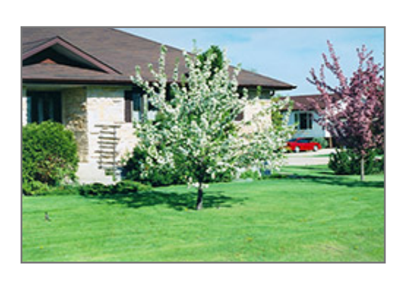
Norkent Apple in bloom

This tree is typically grown in a designated area of the yard because of its mature size and spread. It should only be grown in full sunlight. It prefers to grow in average to moist conditions, and shouldn't be allowed to dry out. It may require supplemental watering during periods of drought or extended heat. It is not particular as to soil type or pH. It is highly tolerant of urban pollution and will even thrive in inner city environments. This particular variety is an interspecific hybrid.