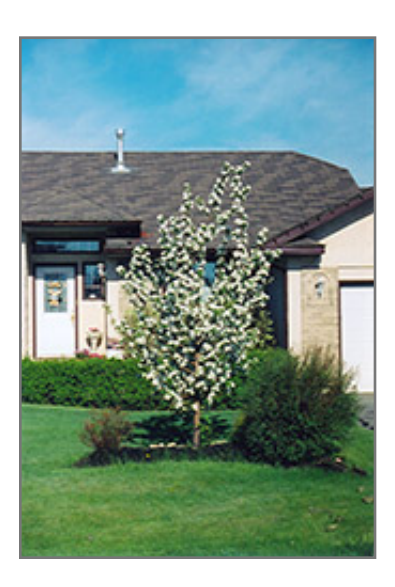
Fall Red Apple in bloom