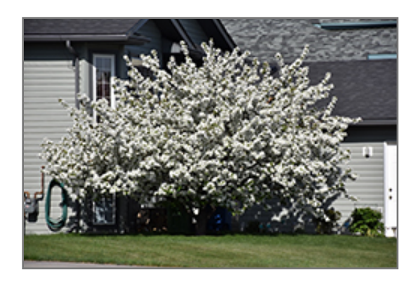
Rescue Apple-Crab in bloom