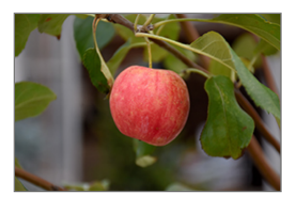
Rescue Apple-Crab fruit

Rescue Apple-Crab features showy clusters of lightly-scented white flowers with shell pink overtones along the branches in mid spring, which emerge from distinctive pink flower buds. It has forest green deciduous foliage. The pointy leaves turn yellow in fall. The fruits are showy red apples with hints of yellow, which are carried in abundance from mid summer to early fall. The fruit can be messy if allowed to drop on the lawn or walkways, and may require occasional clean-up.