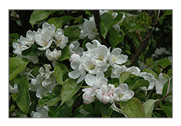
Rescue Apple-Crab flowers

This tree is typically grown in a designated area of the yard because of its mature size and spread. It should only be grown in full sunlight. It prefers to grow in average to moist conditions, and shouldn't be allowed to dry out. It may require supplemental watering during periods of drought or extended heat. It is not particular as to soil type or pH. It is highly tolerant of urban pollution and will even thrive in inner city environments. This particular variety is an interspecific hybrid.