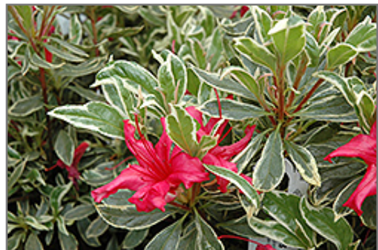
Girard's Variegated Gem Azalea flowers