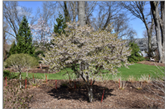
Kojo No Mai Fuji Cherry in bloom

This shrub will require occasional maintenance and upkeep, and is best pruned in late winter once the threat of extreme cold has passed. Gardeners should be aware of the following characteristic(s) that may warrant special consideration;