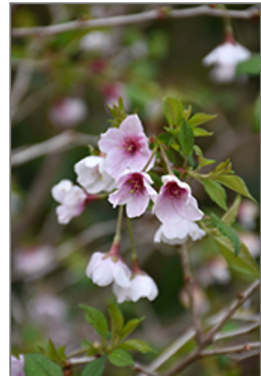
Kojo No Mai Fuji Cherry flowers