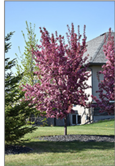
Thunderchild Flowering Crab in bloom

This tree will require occasional maintenance and upkeep, and is best pruned in late winter once the threat of extreme cold has passed. It has no significant negative characteristics.