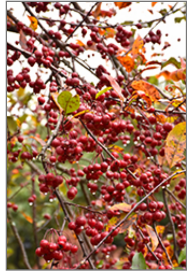
Prairifire Flowering Crab fruit

This tree should only be grown in full sunlight. It prefers to grow in average to moist conditions, and shouldn't be allowed to dry out. It is not particular as to soil type or pH. It is highly tolerant of urban pollution and will even thrive in inner city environments. This particular variety is an interspecific hybrid.