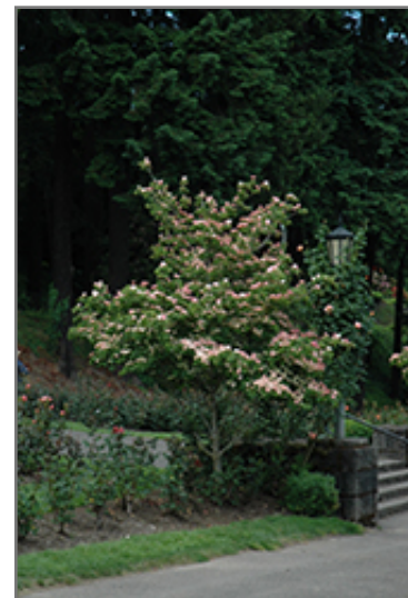
Heart Throb Chinese Dogwood in bloom