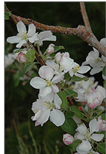
Pink Lady Apple flowers