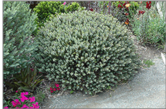
Red Edge Hebe

Red Edge Hebe is recommended for the following landscape applications;