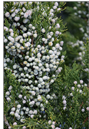
Fairview Juniper fruit