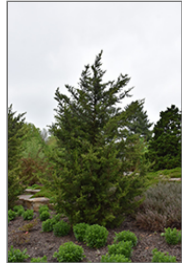
Fairview Juniper