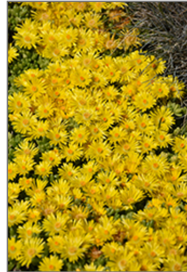
Yellow Ice Plant flowers

Yellow Ice Plant is recommended for the following landscape applications;