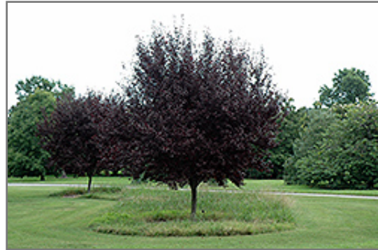
Krauter Vesuvius Plum

This tree should only be grown in full sunlight. It does best in average to evenly moist conditions, but will not tolerate standing water. It is not particular as to soil type or pH. It is highly tolerant of urban pollution and will even thrive in inner city environments. This is a selected variety of a species not originally from North America.