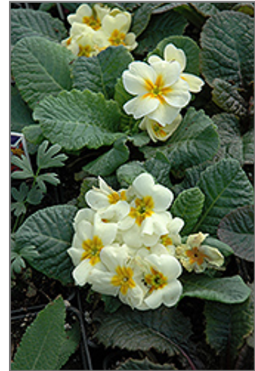
Wanda Primrose flowers

Wanda Primrose is recommended for the following landscape applications;