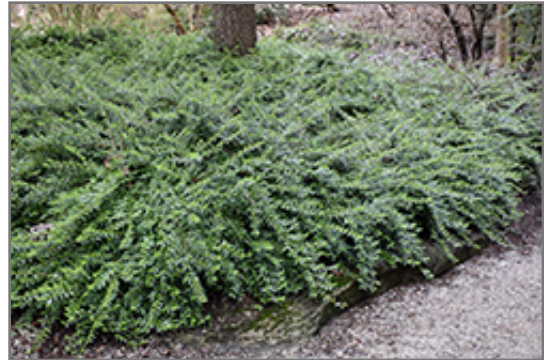
Privet Honeysuckle

Privet Honeysuckle will grow to be about 3 feet tall at maturity, with a spread of 6 feet. It tends to fill out right to the ground and therefore doesn't necessarily require facer plants in front. It grows at a medium rate, and under ideal conditions can be expected to live for approximately 30 years.