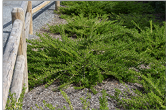
Privet Honeysuckle

Privet Honeysuckle is recommended for the following landscape applications;