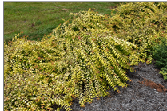
Dream Catcher Beautybush