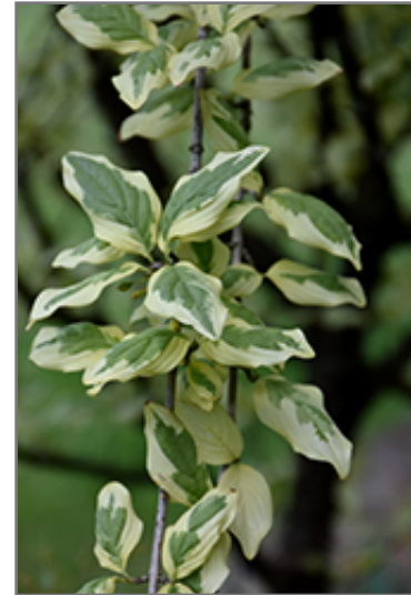
Variegated Cornelian Cherry Dogwood foliage

This is a relatively low maintenance tree, and should only be pruned after flowering to avoid removing any of the current season's flowers. It is a good choice for attracting birds to your yard. It has no significant negative characteristics.