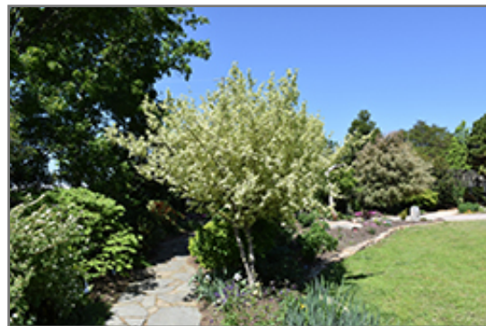
Variegated Cornelian Cherry Dogwood