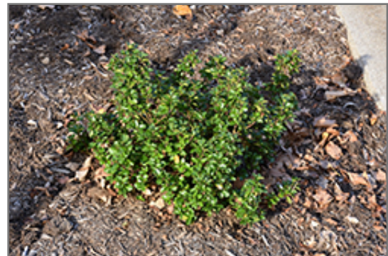
Emerald Magic Meserve Holly