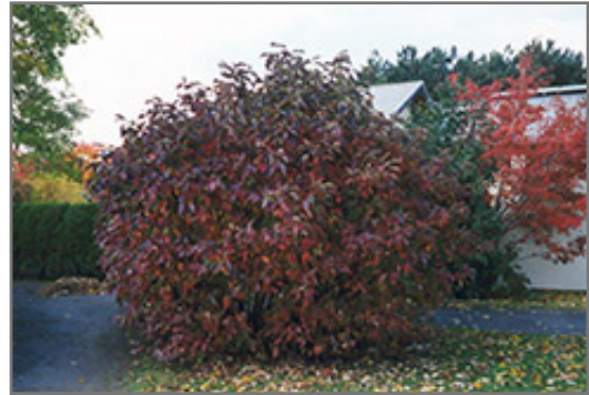
Siberian Dogwood in fall

This shrub does best in full sun to partial shade. It is an amazingly adaptable plant, tolerating both dry conditions and even some standing water. It is not particular as to soil type or pH. It is highly tolerant of urban pollution and will even thrive in inner city environments. This is a selected variety of a species not originally from North America.