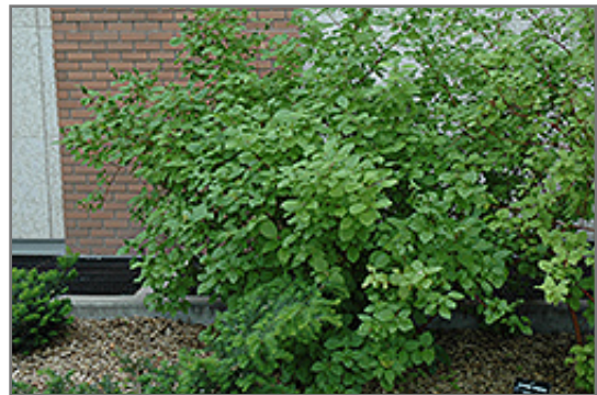
Siberian Dogwood