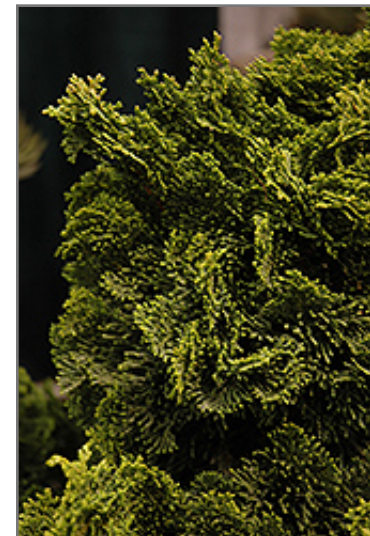
Dwarf Hinoki Falsecypress foliage