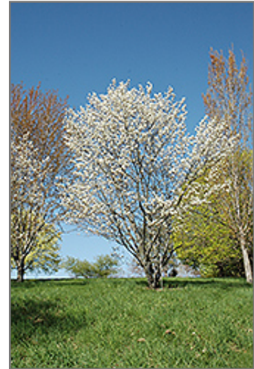
Princess Diana Serviceberry in bloom