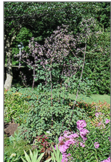
Rochebrun Meadow Rue in bloom