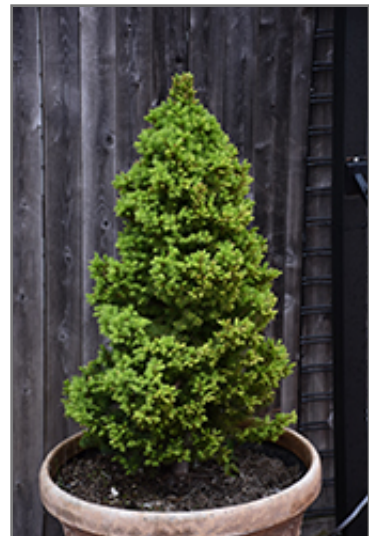
Rainbow's End Spruce