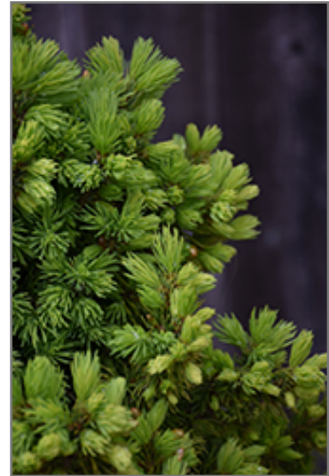
Rainbow's End Spruce foliage

This shrub should only be grown in full sunlight. It prefers to grow in average to moist conditions, and shouldn't be allowed to dry out. It is not particular as to soil type or pH. It is somewhat tolerant of urban pollution, and will benefit from being planted in a relatively sheltered location. This is a selection of a native North American species.