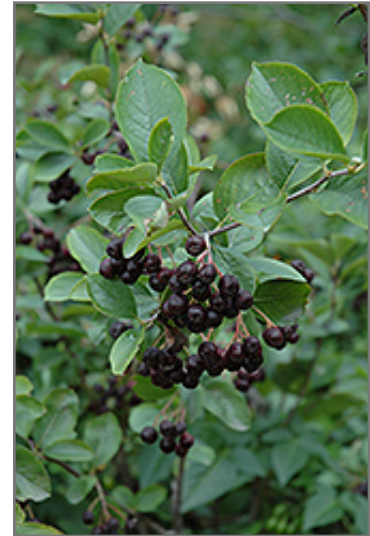
Black Chokeberry fruit