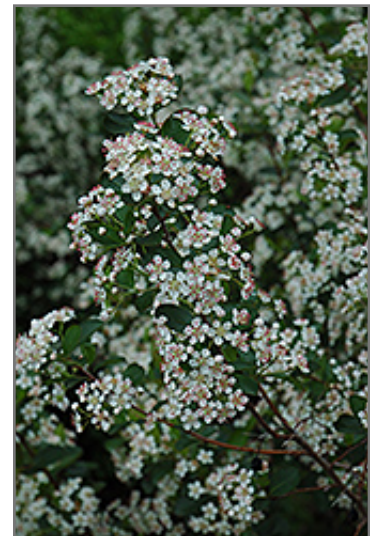
Black Chokeberry flowers