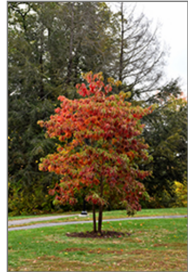
Sassafras in fall