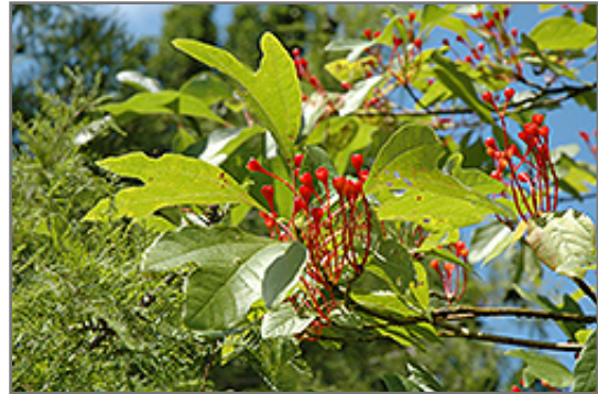
Sassafras flowers

This tree performs well in both full sun and full shade. It prefers to grow in average to moist conditions, and shouldn't be allowed to dry out. It is not particular as to soil type, but has a definite preference for acidic soils, and is subject to chlorosis (yellowing) of the foliage in alkaline soils. It is quite intolerant of urban pollution, therefore inner city or urban streetside plantings are best avoided. This species is native to parts of North America.