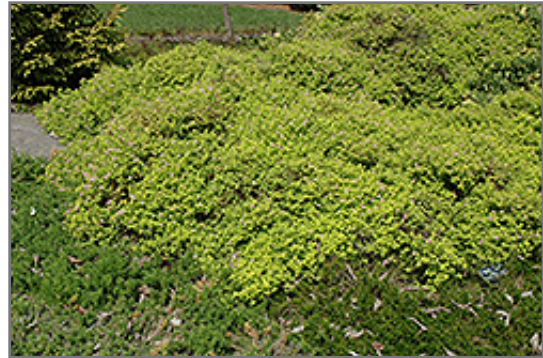
Golden Elf Spirea

Golden Elf Spirea is recommended for the following landscape applications;