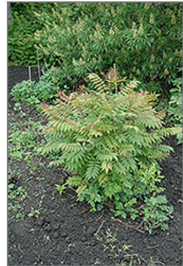
Sem False Spirea