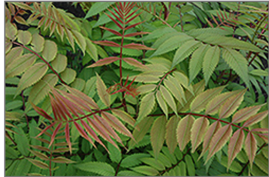
Sem False Spirea foliage

This shrub will require occasional maintenance and upkeep, and is best pruned in late winter once the threat of extreme cold has passed. Gardeners should be aware of the following characteristic(s) that may warrant special consideration;