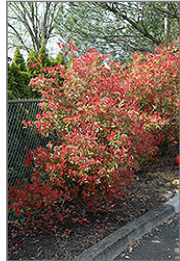
Fraser Photinia in bloom