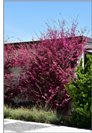
Red-Flowered Chinese Fringeflower in bloom

This shrub does best in full sun to partial shade. It prefers to grow in average to moist conditions, and shouldn't be allowed to dry out. It is particular about its soil conditions, with a strong preference for rich, acidic soils. It is somewhat tolerant of urban pollution. Consider applying a thick mulch around the root zone in winter to protect it in exposed locations or colder microclimates. This is a selected variety of a species not originally from North America.