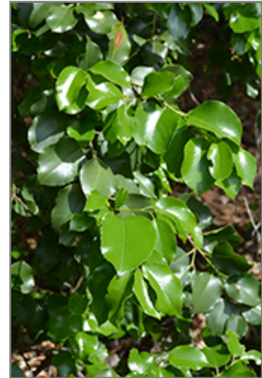
Catalina Cherry foliage

Catalina Cherry is recommended for the following landscape applications;